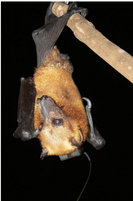
Fig. 2. An adult male Pteropus neohibernicus (Bat G) fitted with a 22-g battery-powered satellite transmitter immediately before release in Papua New Guinea.

On July 21, 2006, a transmitter was deployed on a 1030-g adult male P. neohibernicus at Sewerimabu on the Fly River, Western Province, Papua New Guinea (Figs. 2, 3). The