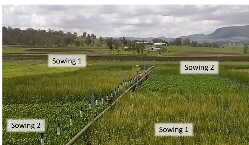
Figure 1. Experimental set up to extend the photoperiod and allow screening of plants at closely matched developmental stages during naturally occurring heat shock events. Lights were installed in the middle of the field, with rows blocked for different sowing dates. Plants closer to the supplemental light flowered earlier than the plants away from light.

Data were analysed using R (R Core Team, 2018). Statistical differences were tested with student’s t-tests at a 5% level.