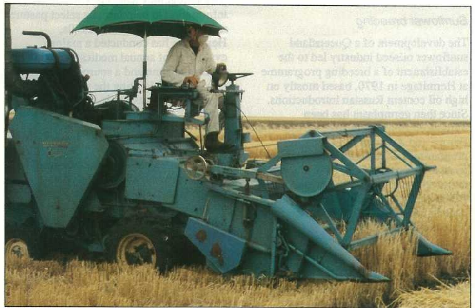
Plate 3. Harvesting barley trial plots in 1989.

The barley breeding programme, established in 1973, has contributed to the rapid expansion of barley production in Queensland. The feed variety Corvette, released in 1973, was widely accepted; and Grimmer, a malting quality variety released in 1976 has become the main commercial variety in Queensland. A new malting variety with improved yield and disease resistance is currently undergoing major seed increase and will