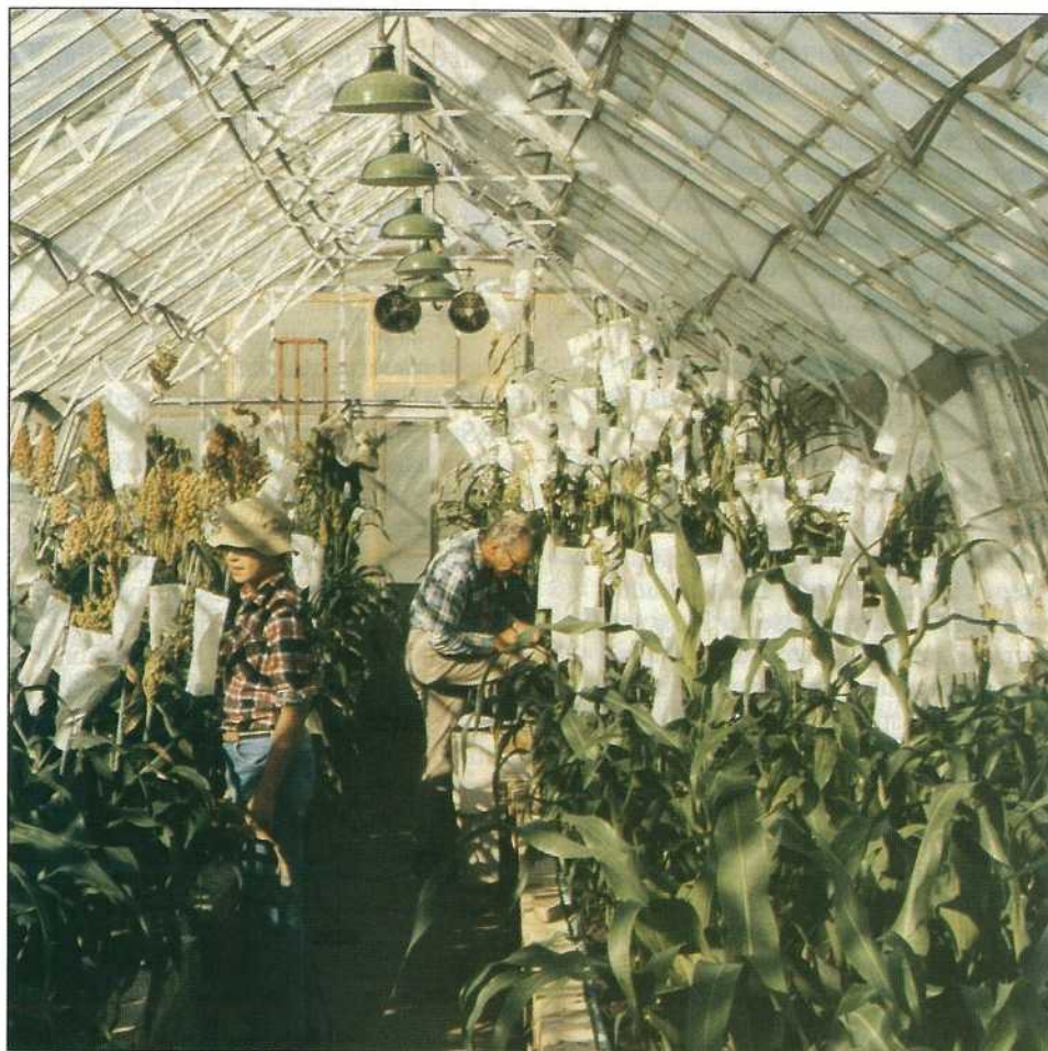
Plate 1. Breeding sorghum in a glasshouse.