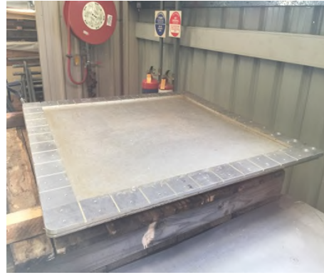
Image 2- Custom mould for panel production.

The weight of sorghum fibre mat needed to give the targeted density range was between 6.3kg and 6.8kg. The panel manufacturing process was the same for both grades of fibre sizes.