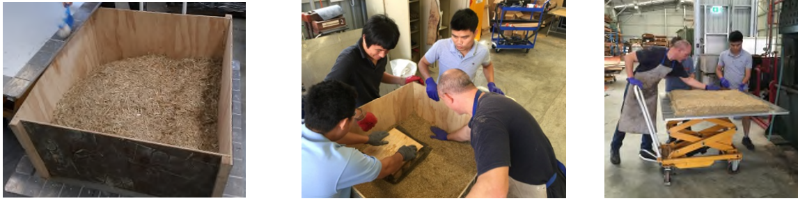
Image 3 - Plywood retaining mould (left), manual press (centre) and panel prior to automated pressing (right)

Trimming: Panels were trimmed to 800mm square on a panel saw to remove edge effects.