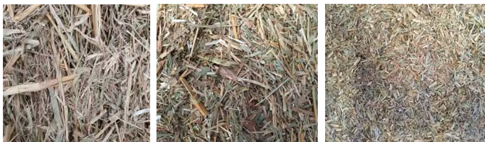
Image 1- Different stages of grind. Unground (left), Hansa Chipper (middle) and Crompton 5mm hammer mill (right)

Grinding: Two panels were manufactured using different fibre sizes. 30Kg of sorghum fibre was passed through a Hansa C7 chipper with the knives set at a distance of 1mm from the anvils. 12Kg was weighed and manually sieved through a 1.5mm mesh to remove fine particles and set aside for use in the manufacture of the first panel . The remaining material was passed through a Crompton series 2000 rotary hammermill fitted with a 5mm screen and the grindings collected in a large plastic bag. This material was also sieved through a 1.5mm mesh to remove fine particles resulting from the grinding process. The 5 mm grindings were used in the manufacture of the second panel . (Image 1)