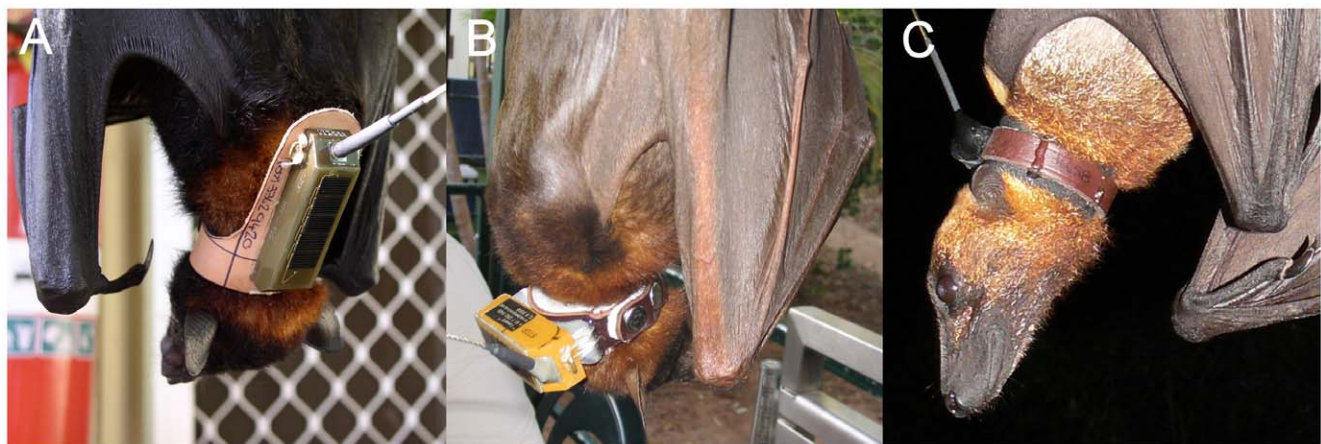
Figure 1. Examples of the three collar designs. A) Collar design 1, an 18 g solar powered PTT deployed on a black flying fox ( Pteropus alecto ) along the dorsal aspect of the neck, between the scapulae and parallel to the axis of the spine. B) Collar design 2, a 12 g solar powered PTT deployed on a little red flying fox ( Pteropus scapulatus ) on the dorsal aspect of the neck and perpendicular to the axis of the spine. C) Collar design 3, a 22 g battery powered PTT deployed on a Bismarck or great flying fox ( Pteropus neohibernicus ) on the dorsal aspect of the neck and perpendicular to the axis of the spine.

Half of the 20 PTTs deployed were solar-powered (Table 1). Transmission and battery characteristics of these PTTs were compared to those of the 10 battery-powered PTTs. Prior to deployment, we assessed battery-charging efficiency under different light conditions on two 12 g solar-powered PTTs mounted on top of a 4 m wooden mast erected in an open area (in Brisbane, Australia) during August and September 2005. The solar panels of one had a southern aspect and thus were not exposed to direct sunlight; the solar panels of the other faced north, and were exposed to direct sunlight. The intended deployment duty cycle of 7 hrs ON and 155 hrs OFF was used, and voltage recorded at the beginning of each duty cycle over a 4-week period. Voltage was recorded from the first signal received which contained sensor data, and within the first 2 hrs of the ON duty cycle. Subsequently, after fully recharging by exposure to a 100 Watt incandescent light bulb at a distance of 15 cm for 12 hours, these PTTs were deployed on two male P. scapulatus (Bats K and L) in October 2005. Data were collected from two other 12 g solar-