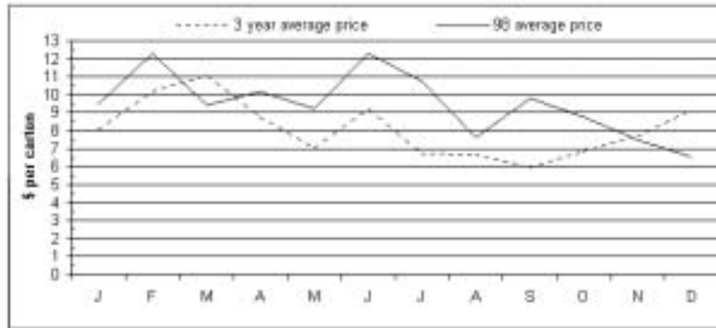
Figure 1. Average price, 1995 to 1997 and 1998 average price per carton on the Brisbane market for lettuce