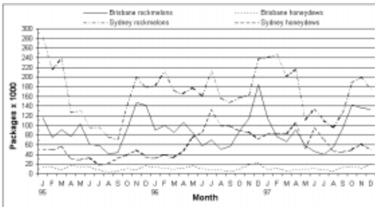
Figure 3. Throughput for 1995 to 1997 on the Brisbane and Sydney markets for rockmelons and honeydews