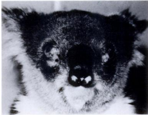
FIGURE 3. An example of keratoconjunctivitis in a koala.

et al., 1977). These point estimates are reported along with lower and upper bounds of the 95% confidence interval (Fleiss, 1981). Additionally, six other koalas had mild degrees of corneal scarring characterized by centralized, circular opaque regions which did not seem to interfere with vision. The conjunctival tissues from only one of these six koalas yielded C. psittaci .