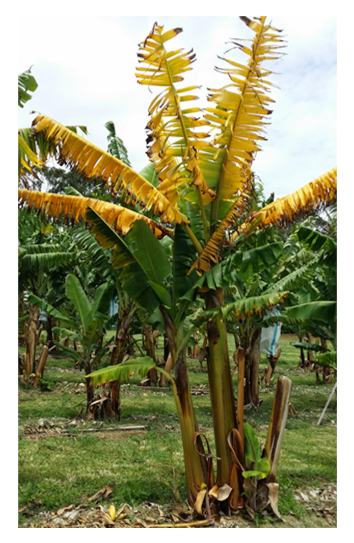
Fig. 1. Banana plants variety Ducasse affected by Fusarium Wilt caused by Fusarium oxysporum f.sp. cubense Race 1, Duranbah Qld, 15 December 2015, photo by Andre Drenth.

from healthy plants be grown in well manured and cultivated soil.<sup>60</sup> No wonder the growers were confused.