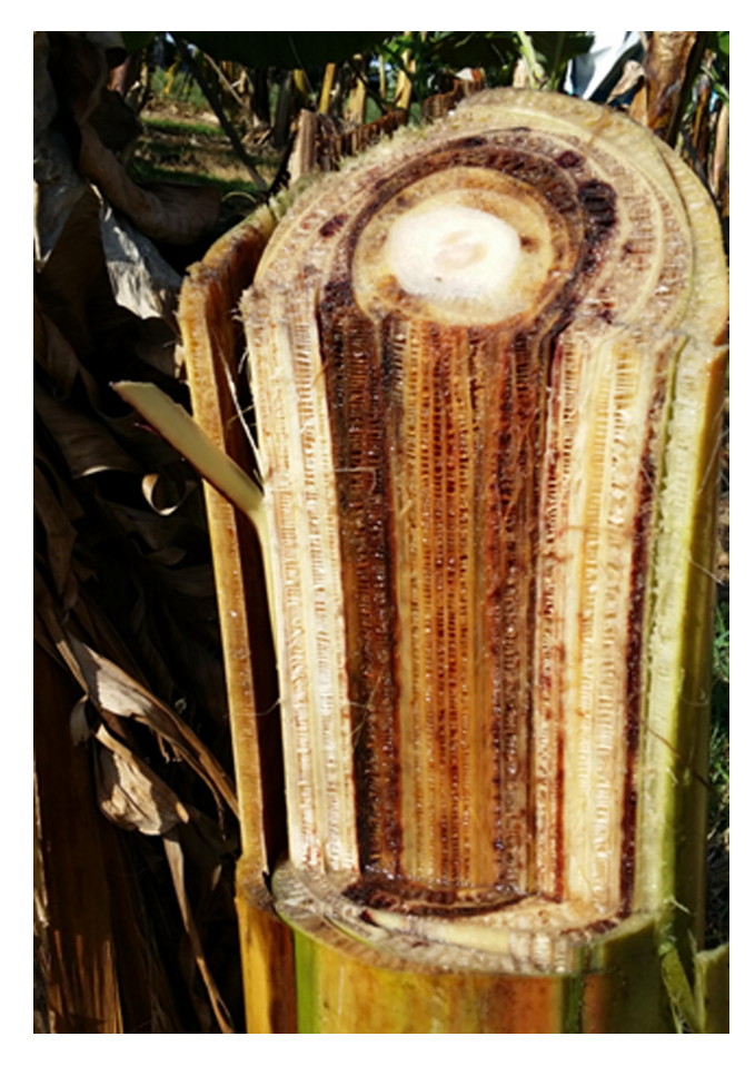
Fig. 2. Internal symptoms in pseudostem of banana variety Ducasse affected by Fusarium Wilt caused by Fusarium oxysporum f.sp. cubense Race 1, Duranbah Qld, 15 December 2015