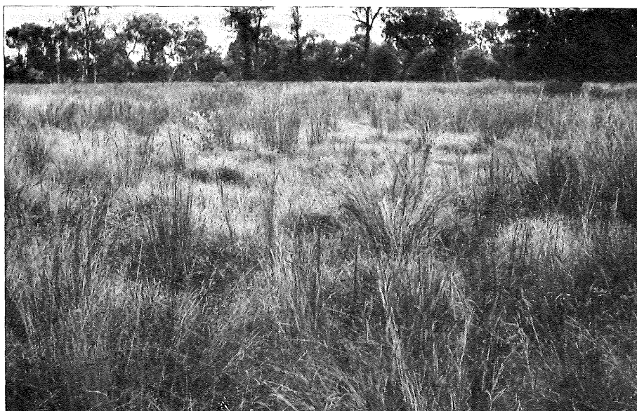
Fig. 5.—A 3-year-old stand of buffel grass ( Cenchrus ciliaris ), established by cultivation on ironbark ( Eucalyptus melanophloia ) country near Emerald, showing reduced vigour and consequent re-invasion by black spear grass.

Buffel grass and Birdwood grass ( Cenchrus setigerus ) were widely planted by western graziers in both small and large trial plots from 1954 onwards. Observations made on a considerable number of these and on several plantings made by the writer indicated that buffel grass will not invade black spear grass communities to any significant extent; the only way in which it can be established is by cultivation to remove the latter. Subsequently the performance of buffel grass is governed by the suitability of the soil. Some re-invasion by black spear grass usually occurs but on the best buffel grass soils the buffel grass can maintain dominance. However, most of the forest country prone to black spear grass growth is too poor with respect to nitrogen, and to a lesser extent phosphorus, to support a vigorous growth of buffel grass (Figure 5). On black spear grass soils which support a reasonable growth of buffel grass, a state of co-existence of the two species is the best that can be achieved. Some black spear grass plants die during droughts but this is offset by seedling establishment in the next good season.