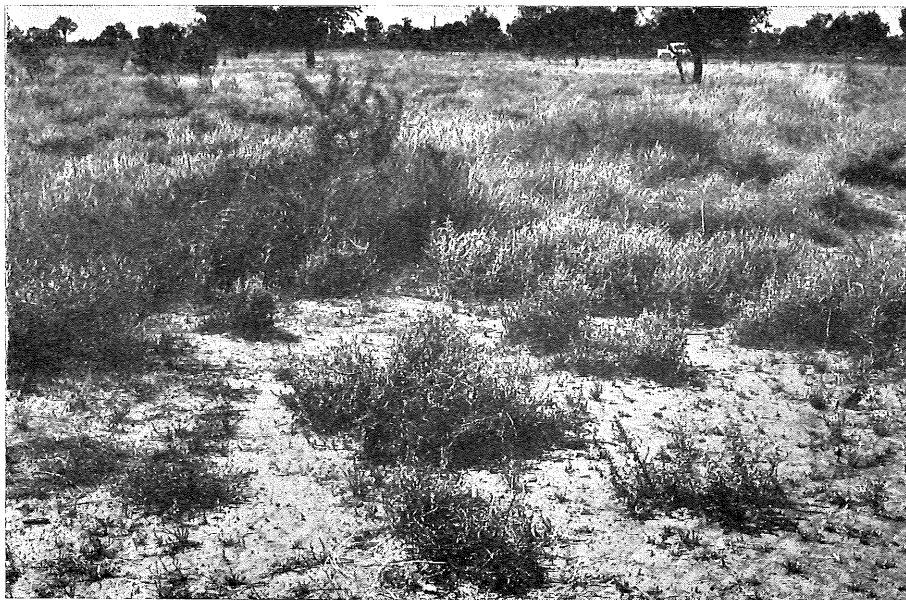
Fig. 4.—In this eastern fringe of a paddock, heavy grazing has led to replacement of black spear grass by goathead ( Bassia bicornis ) and galvanized burr ( Bassia birchii ), right foreground. Better moisture conditions in a gully (middle left) have enabled black spear grass to outstrip the grazing pressure and seed. Buffel grass established in the background after cultivation in 1956 will not eliminate black spear grass but constitutes a much better pasture than goathead and galvanized burr. "Red ridge" country, Blackall district.

Observations made by the writer between Emerald and Barcaldine show that under heavy grazing black spear grass is replaced by the less palatable pitted blue grass or wire grasses, according to type of country (Figure 3). With still heavier grazing these latter species are replaced by dwarf species such as Chloris divaricata and couch grass ( Cynodon dactylon ); such heavy grazing is mainly restricted to the areas near yards and watering points, and the trampling factor would also be important. In extreme cases these dwarf grasses give way to weed species such as galvanized burr ( Bassia birchii ) and goathead ( Bassia bicornis ) (Figure 4), and finally bare ground.