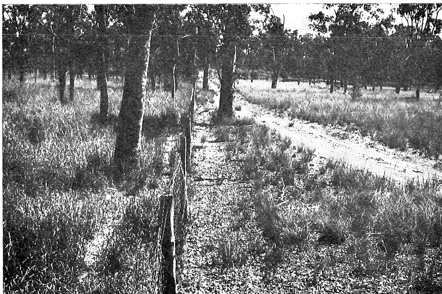
Fig. 3.—The paddock on the left (lightly stocked with cattle) is mainly black spear grass with some kangaroo grass ( Themeda australis ). Heavy stocking with sheep for over 40 years has caused the replacement of black spear grass by wire grass (a species of Aristida ) in the paddock on the right. Box ( Eucalyptus populnea ) forest country near Capella.

Numerous fence-line comparisons made by the writer show that replacement of kangaroo grass by black spear grass as a result of grazing is a common occurrence as far west as Barcaldine. Since kangaroo grass has a wide distribution, including the banks of seasonal watercourses in Central Australia (Hayman 1960), this replacement may well apply in the more western country. Kangaroo grass is present in a belt of forest country at Longreach, and it has also been recorded from the Mitchell grass downs (Davidson 1954).