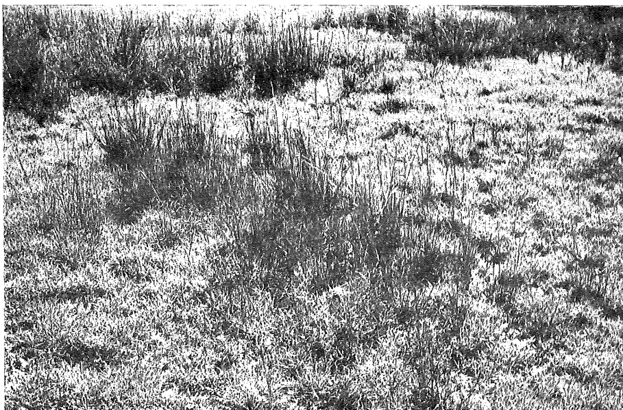
Fig. 6.—Natural replacement of black spear grass by Indian blue grass ( Bothriochloa pertusa ) in box ( Eucalyptus populnea ) forest country near Capella.

Attempts by the writer and by various graziers to establish kapok bush in black spear grass country by broadcasting with and without burning, and by drilling, have all failed. The only instances of successful establishment known were in cleared gidyea scrub after burning; moreover, the kapok bush has not persisted in competition with buffel grass.