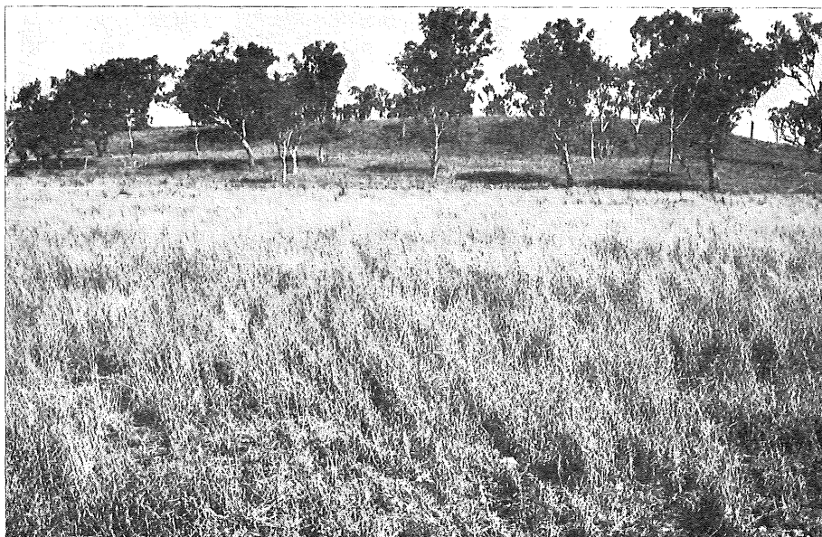
Fig. 2.—Black spear grass dominant on timbered crest but absent from open Queensland bluegrass ( Dichanthium sericeum ) grassland (foreground). Emerald district. The trees are mountain coolibah ( Eucalyptus orgadophila ).

Throughout the region the main occurrence of black spear grass is on forest country. On downs country it is confined to atypical sites such as erosion gullies, ridges of shallow soil and areas of outcropping stone (see Figure 2). A peculiar pattern exists in the linear gilgai formation which occurs on some of the gently sloping downs country in the Springsure/Emerald/Clermont area. Here, black spear grass is confined to the ridges ("puffs").