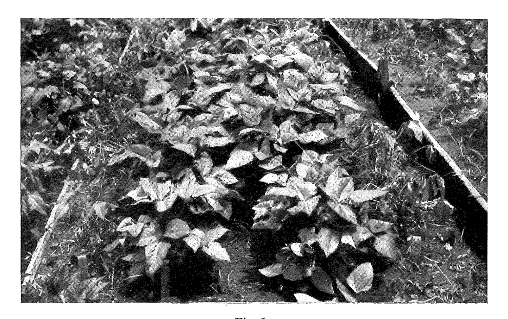
Fig. 1. Nursery Plots. Two centre rows of Blackeye 5 bordered by rows of Poona,

Seed of most varieties was in short supply and replication had to be dispensed with. However, the susceptible Poona was sown in rows in such a pattern that every variety being tested was adjacent to it. This variety died out in all plots as a result of stem rot infection, indicating an even distribution of the disease in the nursery.