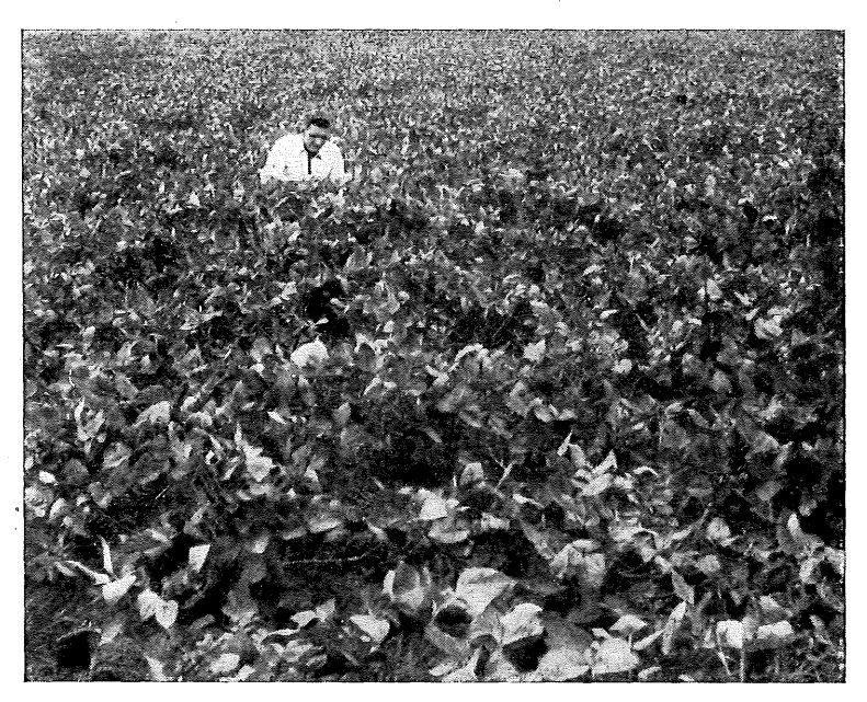
Fig. 2. The Cristaudo Variety of Cowpea Growing on Infested Soil.

The results of these two trials, coupled with glasshouse figures, indicated that Giant and Cristaudo, two varieties available commercially, possessed good field resistance while the remainder of the varieties were of little value. The stand produced by Cristaudo in the first trial is shown in Fig. 2.