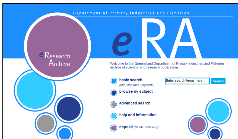
Figure 1. DPI&F eResearch Archive Home Page

The software upgrade went smoothly with minimal downtime. Departmental web designers worked with the Library team to design and create the new home page. This was followed by data migration, user testing, creation of help information for public and staff users and promotional material. The upgrade, data migration and hosting service required considerable communication with the EPrints staff in Southampton and, despite the time difference, we were extremely impressed with their speed of response and their willingness to fix problems and provide solutions. Prior to the repository going live, data was provided to several repository harvesters such as OAISTER and ARROW and search engines such as Scirus and Google Scholar ensuring that the discovery of records in the eResearch Archive will be greatly enhanced.