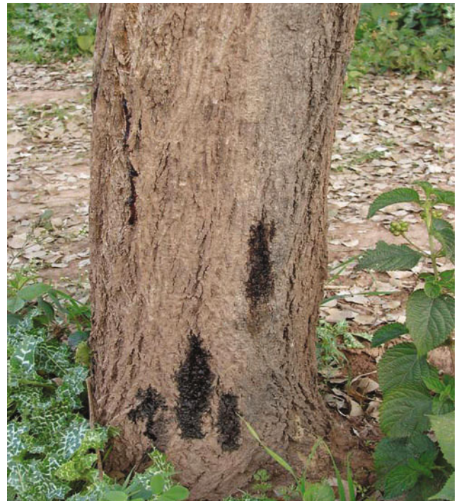
Fig. 1. Mature shisham tree showing initial infection symptoms of stem gummosis from Ceratocystis fimbriata infection.

Ceratocystis fimbriata (Ceratocystiaceae: Microascales) has been reported from a number of hosts around the world showing similar decline symptoms. These include mango ( Mangifera indica ), coffee ( Coffea arabica ), apricot ( Prunus armeniaca ), almond ( Prunus amygdalus ), Eucalyptus spp (Baker et al. 2003), citrus ( Citrus sp.) (Borja et al. 1995) and rubber ( Hevea brasiliensis ) (Silveira et al. 1994). No previous record was found in the literature of an association of this fungus with shisham decline, but a possible association of this fungus with the disease was conjectured because of symptom similarities between shisham decline and mango decline caused by C. fimbriata .