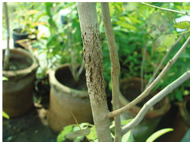
Fig. 4. Young shisham plants showing bark-cracking symptoms from Ceratocystis fimbriata infection.