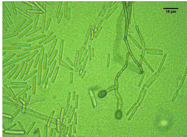
Fig. 3. Conidia and conidiophore of Ceratocystis fimbriata isolated from an infected shisham tree (bar = 10 \mu\text{m} ).

Decline symptoms were observed after 8 weeks, both on plants inoculated with C. fimbriata individually and on plants inoculated with C. fimbriata combined with F. solani . (Fig. 4). Plants inoculated with C. fimbriata alone, showed drooping of leaves, bark splitting 2–3 inches above inoculation point oozing gum. When the bark was removed at these sites, necrotic dark brown to black tissue was observed. Similar symptoms were observed in the case of combination treatments with C. fimbriata and F. solani . No conspicuous symptoms were observed on the five plants inoculated with F. solani alone, although a few