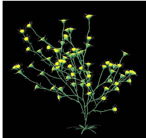
Figure 1. Virtual yellow starthistle

To produce a visual simulation of the morphogenesis of yellow starthistle, a modular, component-based approach was taken, using L-systems modelling. First, a base model of the plant's bolting, branching and flowering behaviour was constructed using casual observations of real plants. Second, the model was parameterised to fit data on morphology of yellow starthistle plants taken from three different locations in northern California: trial sites at Cache Creek, Bear Creek, and Putah Creek. Plants were collected throughout the growing season, dried, and later digitised using a sonic digitiser. Data from the digitiser were analysed and relationships between time and various aspects of morphology were devised. The base model was adjusted in light of these data, and parameterised to fit mean values for the different field sites from which data was collected.