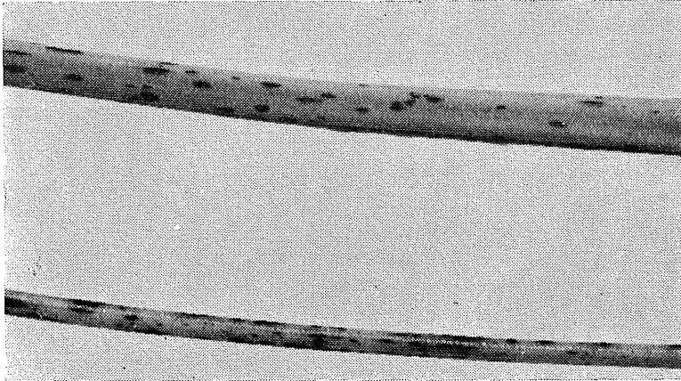
Fig. 2.— Pleiochaeta brown spot of bean. Natural infection of stems.

The reddish brown leaf spots (Figure 3) are rarely more than 2 mm in diameter and tend to be delimited by the veins and veinlets. The centres of the lesions eventually fall out, leaving ragged holes. Invasion of the veins on the underside of the leaf also occurs, producing small dark lesions. Infection of the leaves can be so severe that premature defoliation results. Numerous conidia are borne on the leaf spots.