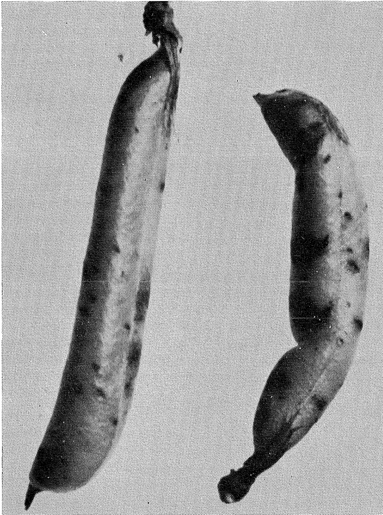
Fig. 4.— Pleiochaeta brown spot on pods of Crotalaria mucronata .

Symptoms on streaked rattlepod and Gambia pea consist of a spotting of leaves, stems and pods. Infected pods of the former show considerable distortion (Figure 4). The symptoms exhibited by infected cowpeas are very similar to those produced on the bean.