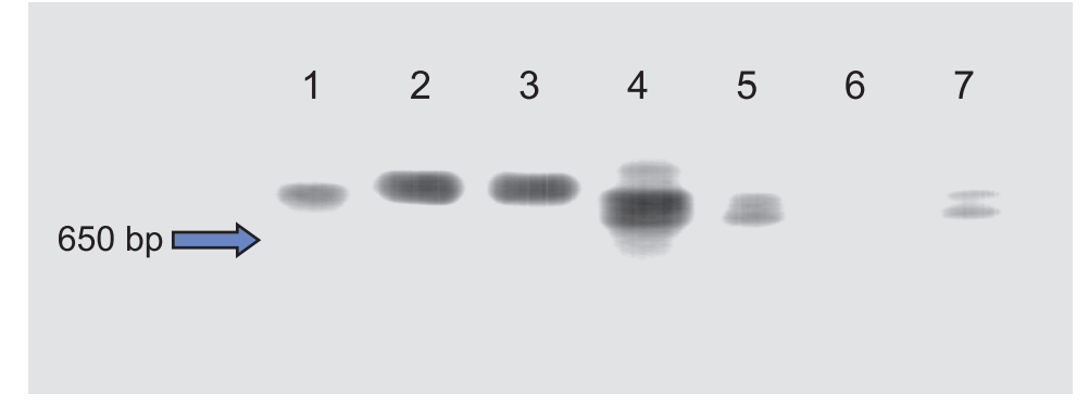
Fig. 3. Southern hybridisation using the insert sequence from pPS001 as a probe. Track 1, the insert band from pPS001; 2–3, plasmid pPS001 and an independently cloned version of the same; 4, reamplification from pPS001 using primer OPA07; 5, amplification from Th. intermedium using primer OPA07; 6, amplification from susceptible Hartog wheat using primer OPA07; 7, amplification from resistant TC14 wheat using primer OPA07.

PCR reactions using seed-extracted DNA consistently detected the presence of Bvd2 -resistant chromatin (Fig. 4).