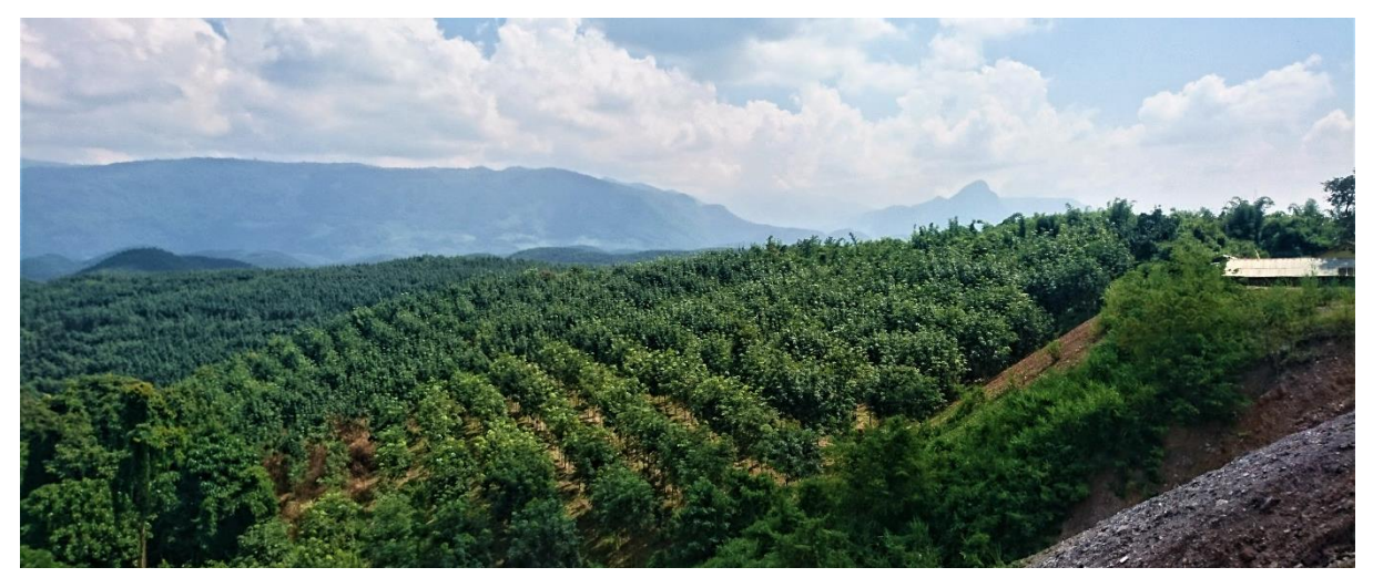
Figure 1: Rubber plantations in the Landscape