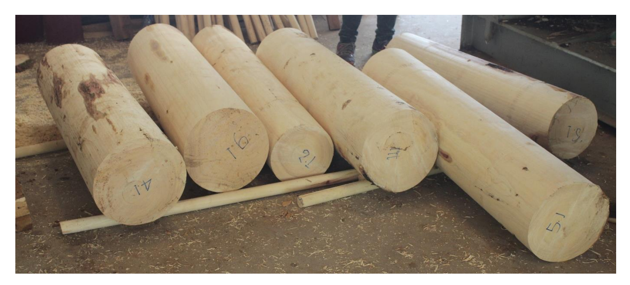
Figure 2: Peeled rubber logs from Luang Namtha at NUoL