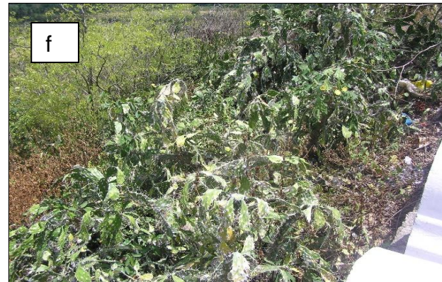
Figure 2. Various weed infestations in Sri Lanka: M. micrantha (a), L. camara (b), C. odorata (c), P. crassipes (d), P. stratiotes (e), O. monacantha damaged by D. ceylonicus (f).

A further eight biological control agents, which were not intentionally released into Sri Lanka, were found during the survey, possibly having spread from India or brought in on imported plants. Five of these agents were new records for Sri Lanka: Calycomyza lantanae (Frick) (Diptera: Agromyzidae), Crociosema lantana Busck (Lepidoptera: Tortricidae), Passalora lantanae (Chupp) U. Braun & Crous var. lantanae (Capnodiales: Mycosphaerellaceae) and Teleonemia scrupulosa Stål (Hemiptera: Tingidae) on L. camara , and Puccinia xanthii Schweinitz on Noogoora burr Xanthium strumarium L. (Asteraceae).