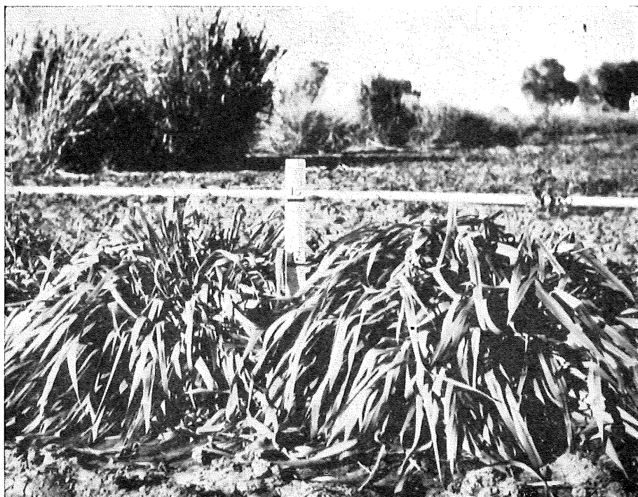
Fig. 1.—Typical plants of Ronpha grass.

Ronpha grass produces inflorescences in abundance over an unusually long period. This lengthening of the flowering period has often been observed in male-sterile plants belonging to pure species and interspecific and intergeneric hybrids. Flowering in Ronpha grass is very incomplete. Some florets exert both anthers and stigmas quite normally, but the anthers are slender and often shrivelled, and they do not dehisce. Some florets do not exert the stigmas nor the anthers and