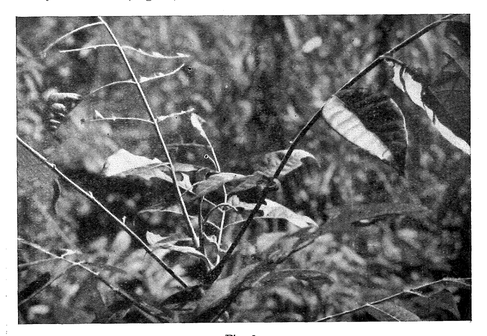
Fig. 1. Small Red Cedar Tree Almost Defoliated by Looper Larvae.

During an insecticide trial against the cedar shoot borer, Hypsipyla robusta (Moore), at Imbil in 1955, newly established plantation trees of red cedar ( Cedrela toona Roxb. var. australis (F.Muell.)C.DC.) were attacked by larvae of the cedar looper, Pingasa sp. (Geometridae), and some trees were severely defoliated (Fig. 1.).