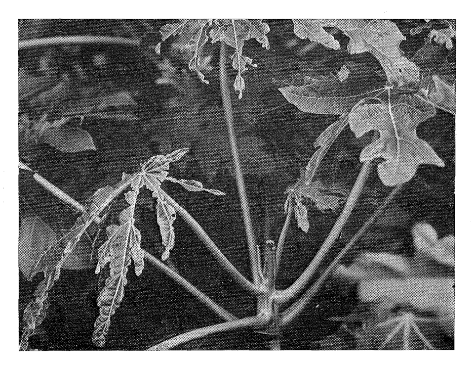
Fig. 3.—Early symptoms on papaw infected from tomato.

In addition, a block of 200 papaw seedlings was established in the field, and when they were approximately 2 ft high, 16 adjacent plants were selected from these. Alternate plants were colonized by dodder from the same tomato plant as described above and the remaining eight by uninfected dodder. After 11 weeks, two papaw plants colonized by dodder from the infected tomato developed typical early symptoms of yellow crinkle disease and a third plant showed symptoms shortly after (Figure 3). The disease then continued to