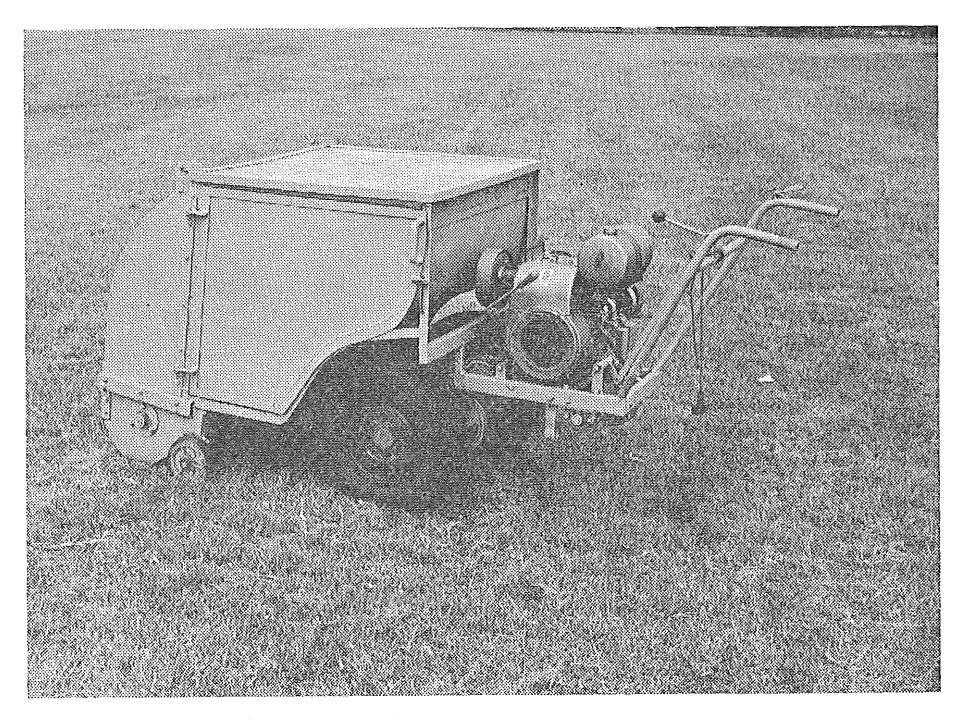
Fig. 1.—General view of harvester ready for use.

The cutting head and cover, obtained from a "Howard 2000" flail mower, are bolted to the frame, which is fabricated from 5 \text{ cm} \times 2.5 \text{ cm} R.H.S. steel. Cut material is blown directly into the sample bin located behind the cutting