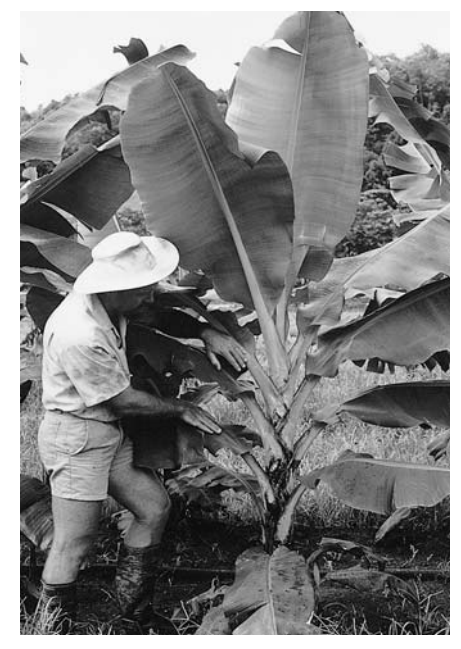
Traveller's palm appearance of diseased plant.