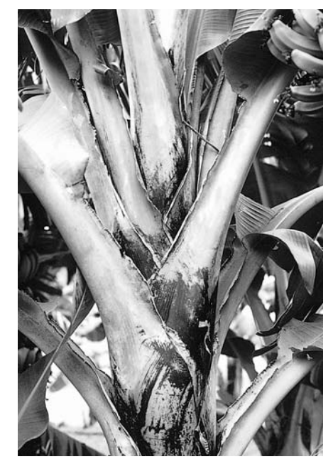
Choking of diseased plant.