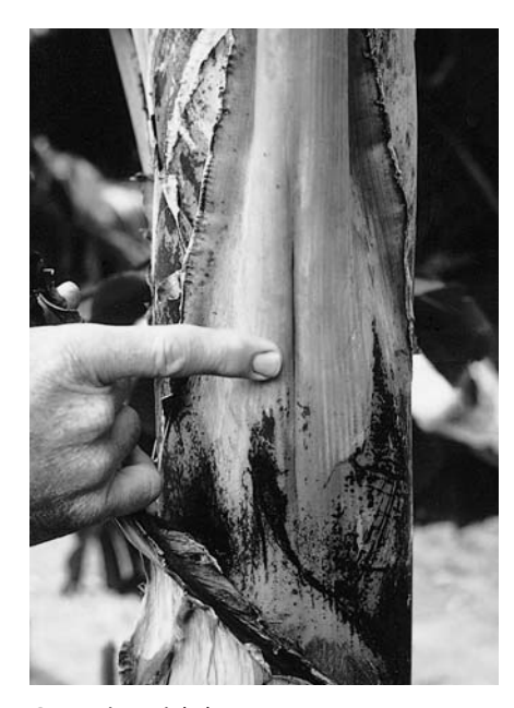
Groove in petiole base.