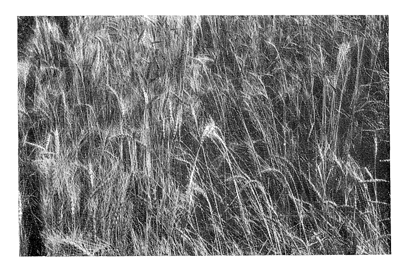
Fig.2.-Close-up of K.G.P.F. plots. Control plot on the left; inoculated plot on the right.