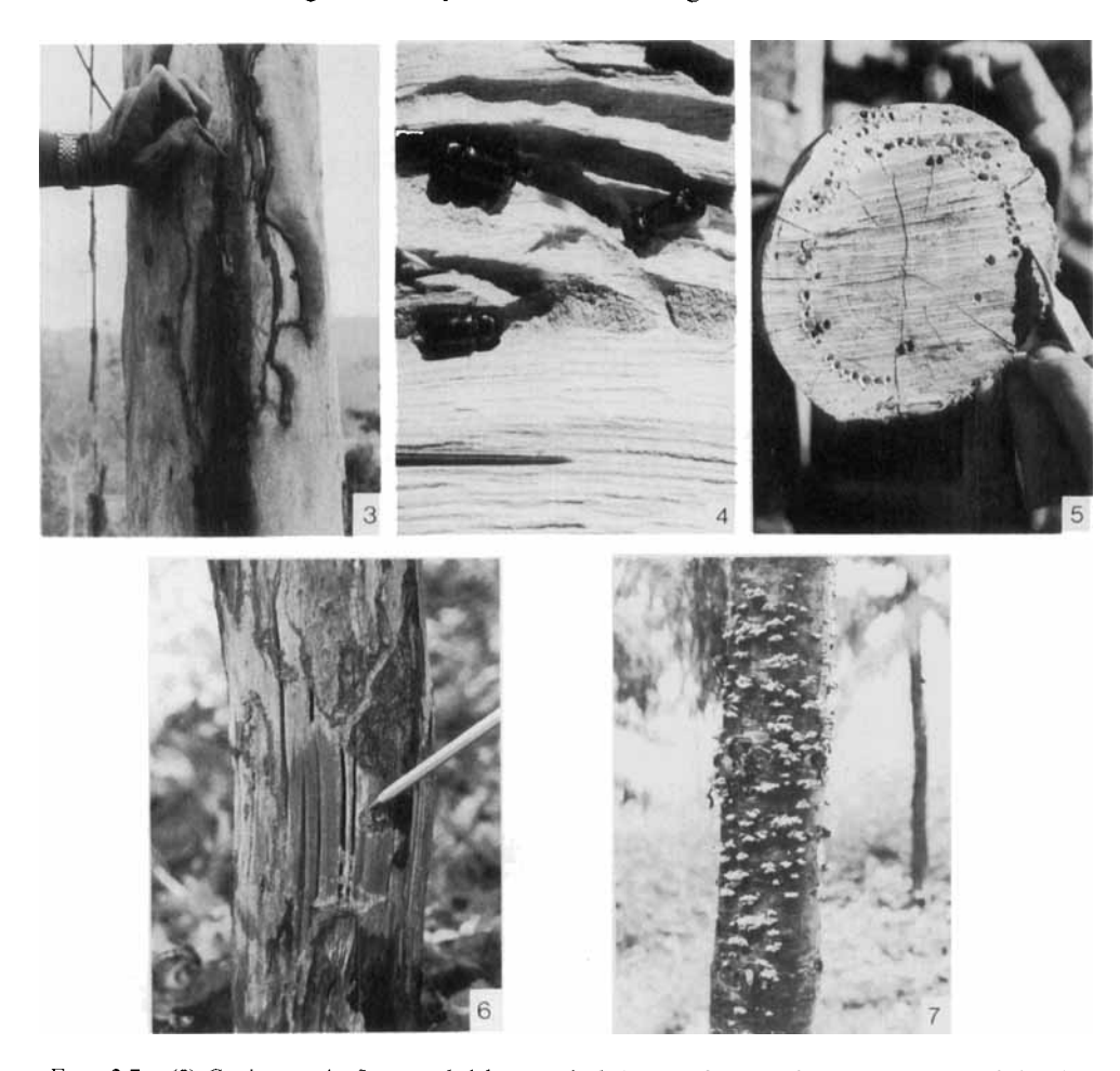
FIGS. 3-7.--(3) Copious resin flow exuded by scorched E. citriodora tree in response to attack by the platypodid Crossotarsus biconcavus Schedl. (4) Adults of Xylothrips religiosus Boisduval in stem of burnt E. torelliana tree at Heads Hump Logging Area, Bulolo. (Adult length approximately 7 mm). (5) Cross section of the stem of a burnt E. torelliana tree showing tunnels of X. religiosus in the sapwood. (6) Damage caused to the stem of a scorched A. cuminghamii tree by Coptotermes pumuae Snyder at Heads Hump Logging Area, Bulolo, 4 months after the fire. (7) Fruiting bodies of Schizophyllum commune on the stem of a scorched A. cuminghamii tree.

Scorched A. cunninghamii trees were extensively damaged by C. pamuae (Fig. 6). After 12 months the lower stems of many of the attacked trees had been completely hollowed out and a few trees had fallen to the ground. No C. pamuae attack was found in the adjacent plot of burnt A. cunninghamii, but 2 trees were attacked by S. sanctaecrucis. Damage caused by this termite was slight and was confined to the roots